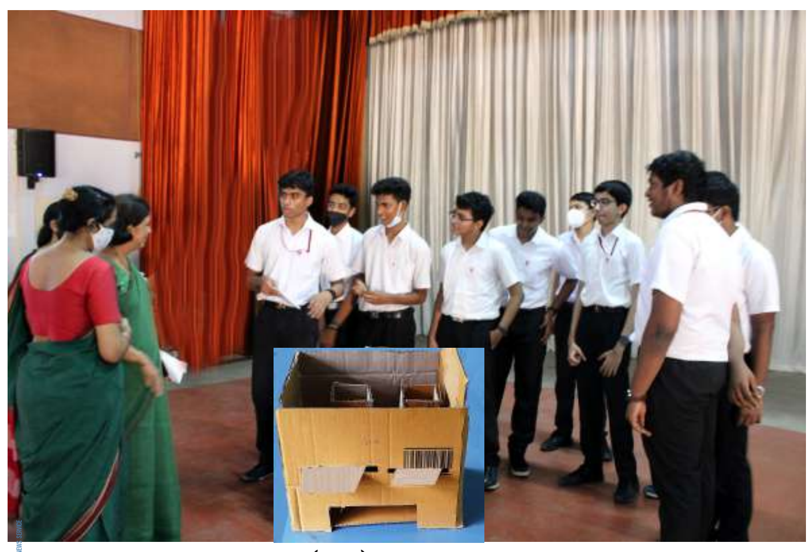
The boys of XI B, the winners of the FIRST PRIZE (SENIORS), explaining the working principles of their creation, christened 'LOYOLA ATM'