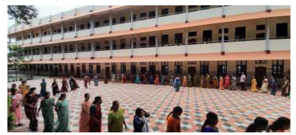
A lighter moment during the staff orientation session: Breaking the non-existent ice!