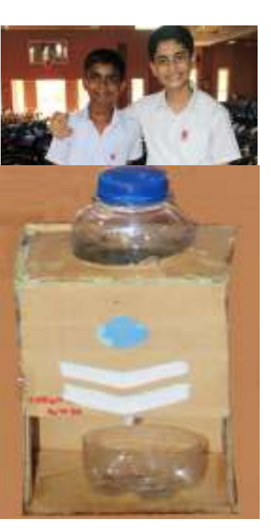
SECOND PRIZE (JUNIORS): STD VII C