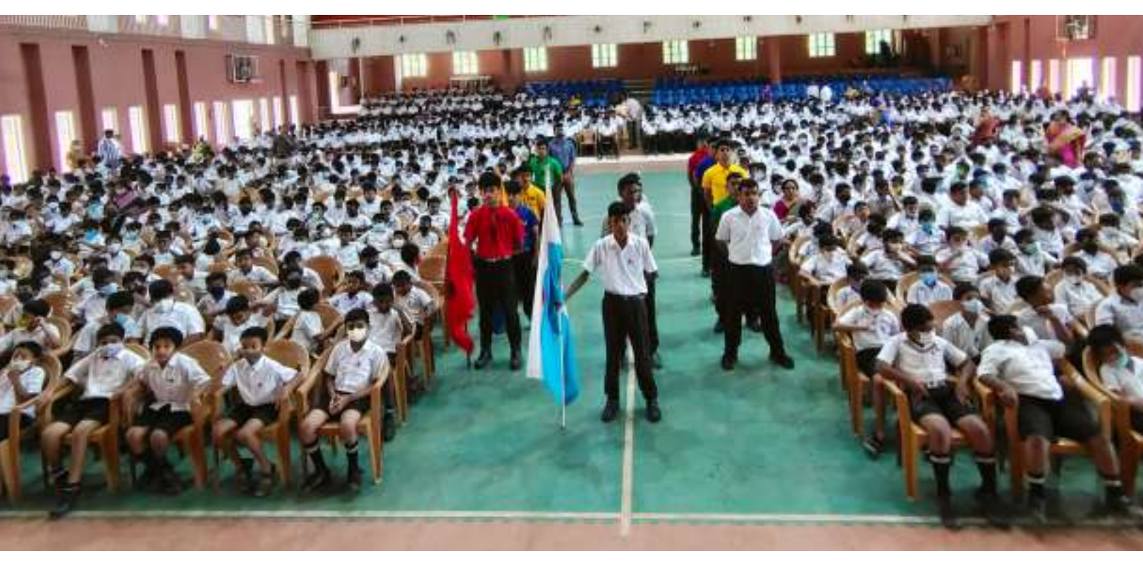
Prelude to the transfer of responsibilities