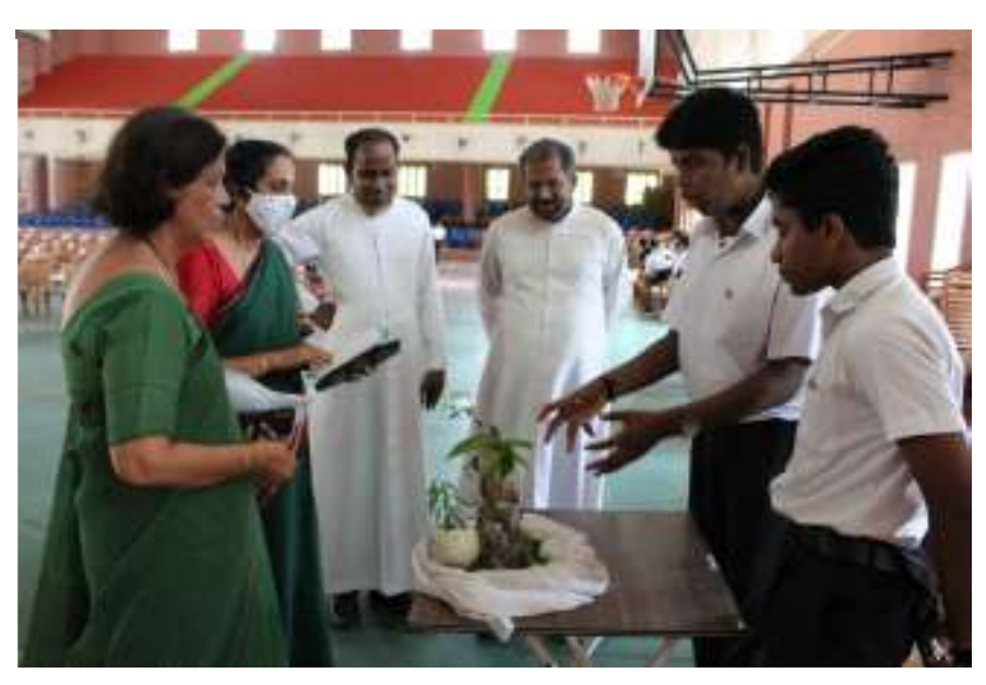
SECOND PRIZE (SENIORS): STD IX C