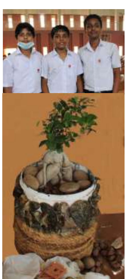
THIRD PRIZE (SENIORS): STD VIII C