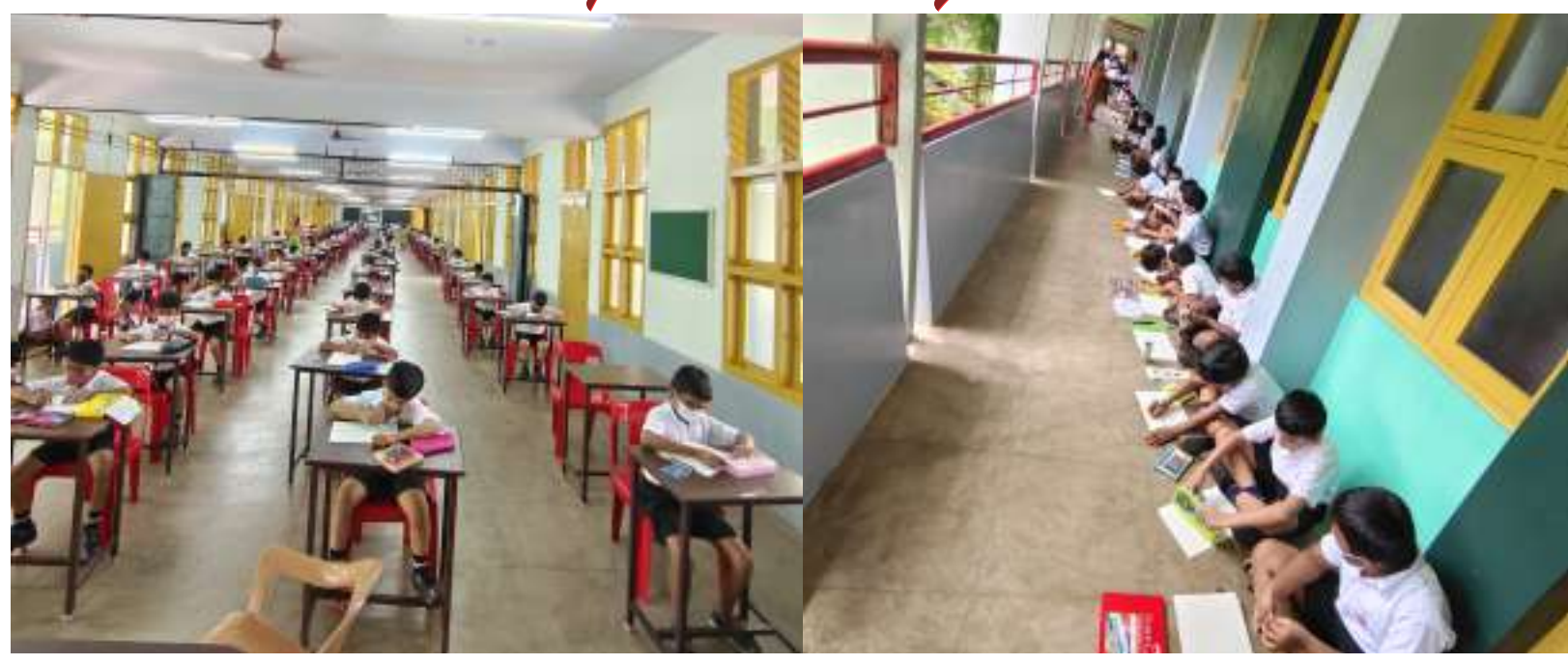
Berchmans Hall brimming with participants of Environment Day Drawing and Painting Competitions