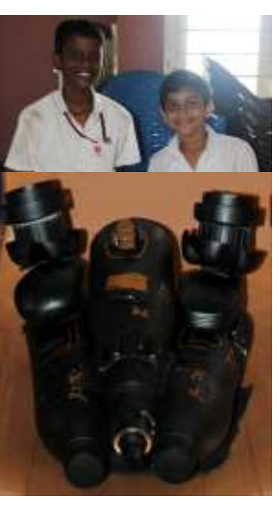
SECOND PRIZE (JUNIORS): STD VII A